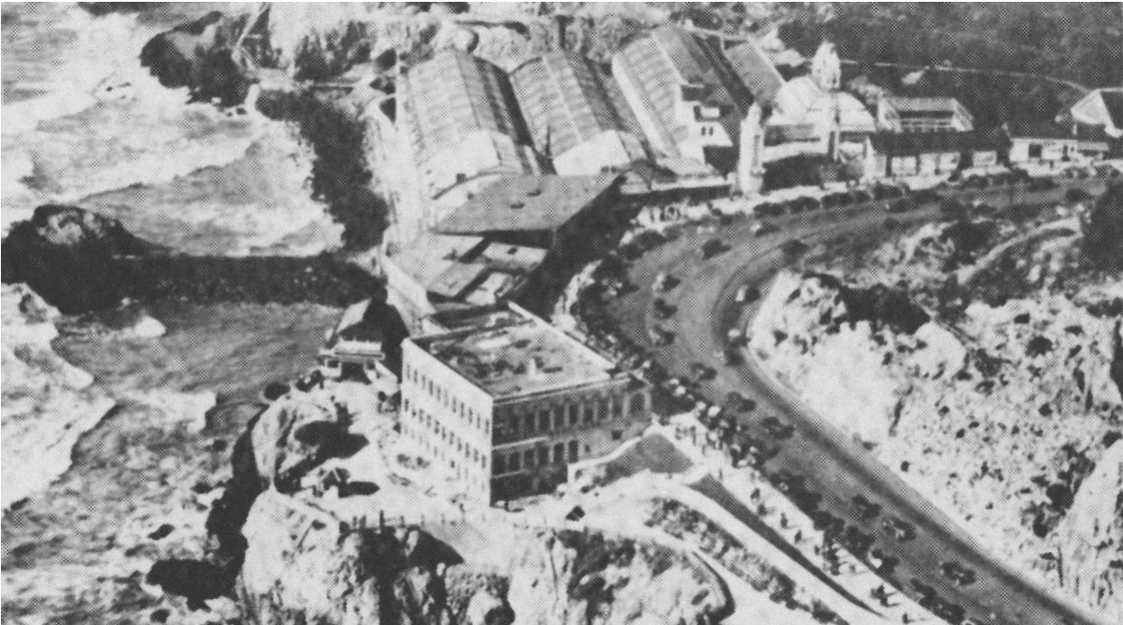
History #13: Aerial view of the Cliff House and Sutro Baths, 1937. (CLR, 1993)