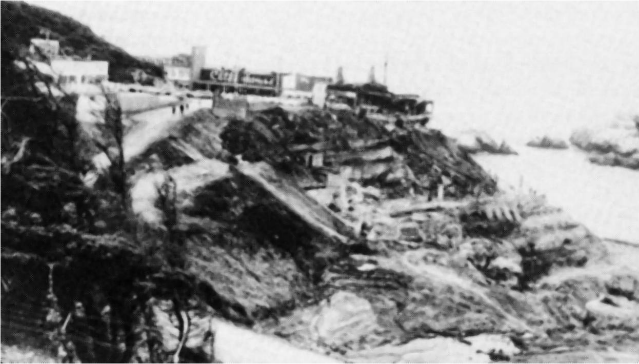
History #14: Sutro Baths following the fire in 1966. (CLR, 1993)